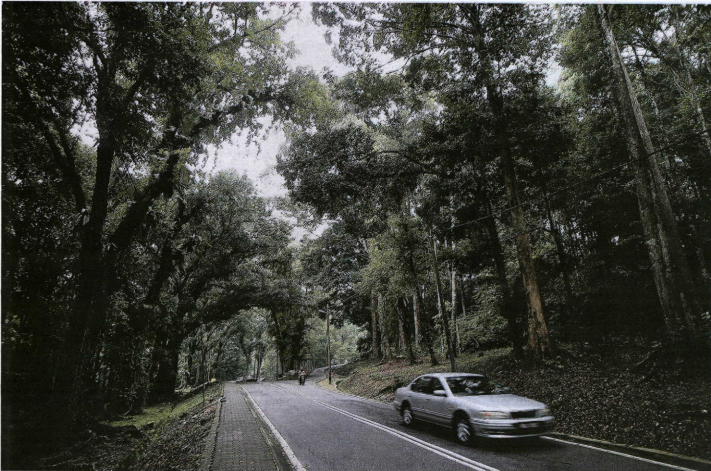
Scenic drive: FRIM in Kepong offers a quick escape into nature. -- filepic