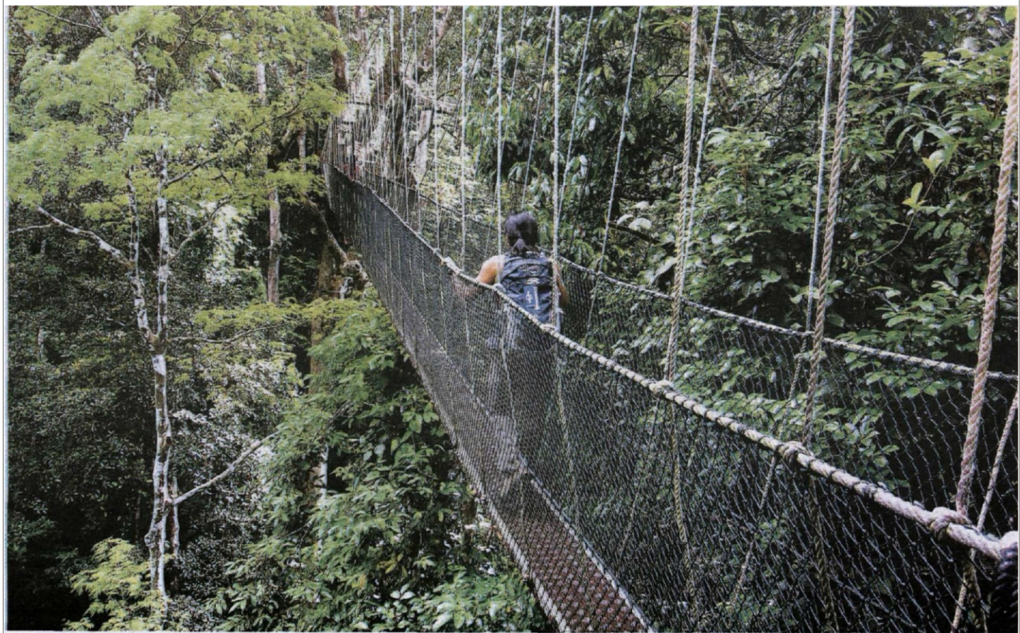
Experience nature: The 150m Canopy Walk is one of the many attractions at FRIM.